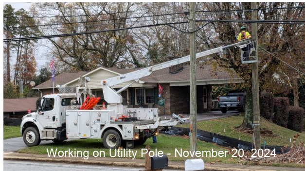
Working on Utility Pole - November 20, 2024