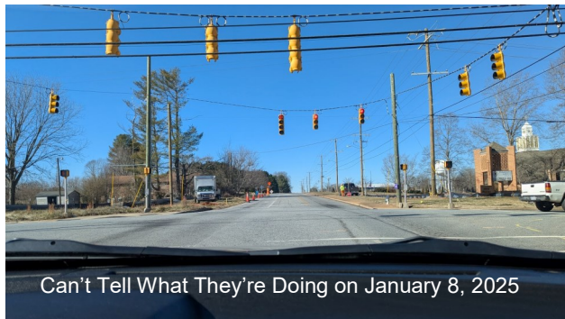
Can't Tell What They're Doing on January 8, 2025