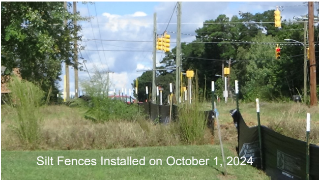
Silt Fences Installed on October 1, 2024