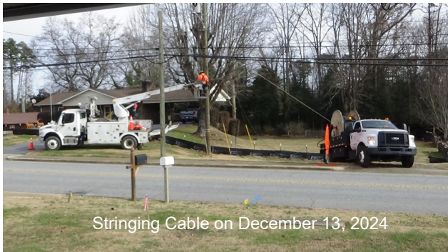
Stringing Cable on December 13, 2024