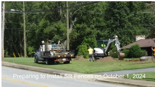
Preparing to Install Silt Fences on October 1, 2024