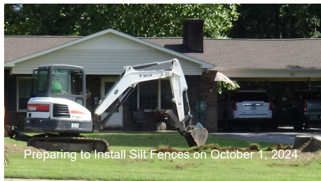
Preparing to Install Silt Fences on October 1, 2024