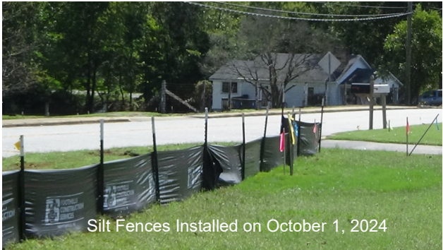
Silt Fences Installed on October 1, 2024